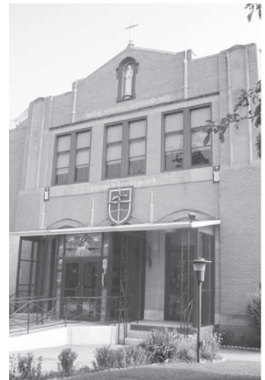
421 Coates Street, Bridgeport, PA

Two Beautiful Churches! One Great Parish