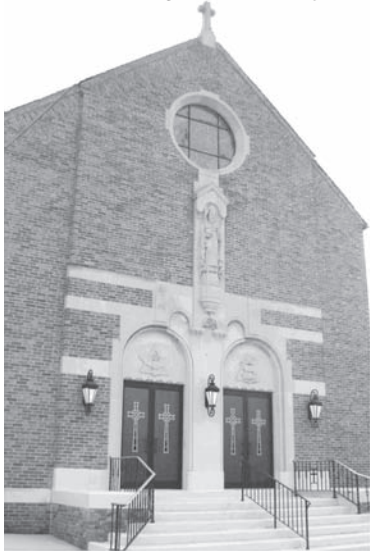
464 Ford Street, Bridgeport, PA

Serving the people of Bridgeport, Swedesburg and areas of King of Prussia & Swedeland since 1892. Serving the people of the former Slovak Catholic Parish of Our Mother of Sorrows (OMS) since 2001.